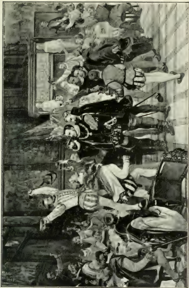
THE BANQUET OF THE GUEUX OR BEGGARS. Painting by Ch. Soubre.